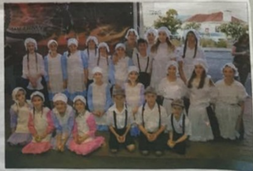
LIVE PERFORMANCE: Compton Primary School students perform at the Mount Gambier RSL Gallipoli Ball earlier this year.

Students acted a scene set in a 1915 school classroom and sang songs, including It's a Long Way to Tipperary , Pack Up Your Troubles and When You're Smiling in front of a packed audi-